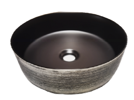
Drain not provided